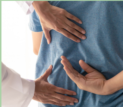
Preventing and Relieving Back Pain