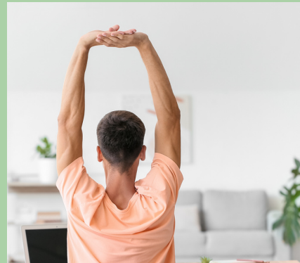
Ways to Manage Chronic Pain