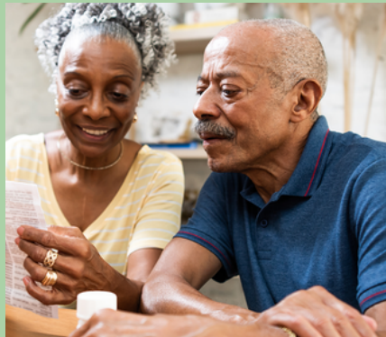
Pain Medication Safety