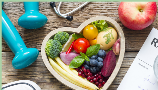
Additional Therapies to Help Manage Pain